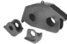
Quality rotor caps in alloy & manganese steel