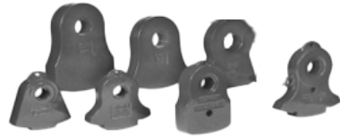
Hammers & pin protectors in manganese, DHT, & alloy steels

Since its establishment in 1961, Falvey Steel Castings has been unwavering in its commitment to customer service. Our focus on understanding and meeting our customers' needs, combined with our ability to provide the highest quality castings at a competitive price, has positioned Falvey as a global leader in the wear parts industry. Our unique blend of metallurgy and stringent quality control policy allows us to supply wear replacement parts with confidence, ensuring a perfect fit for our customers. We stand behind every part we sell, guaranteeing their quality and fit.