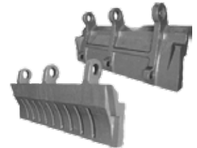
Roof & upper mill castings