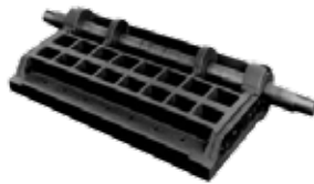
Kickout & reject doors for all model shredders.