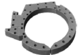
Side wall liners

To further enhance our catalog of shredder wear castings, Falvey Steel Castings has acquired the engineering, pattern, and technical assets of the former Columbia Steel Casting Company . Building upon this product development and metallurgical research allows Falvey Steel to provide the scrap metal shredder industry with enhanced designs and a high standard of quality.